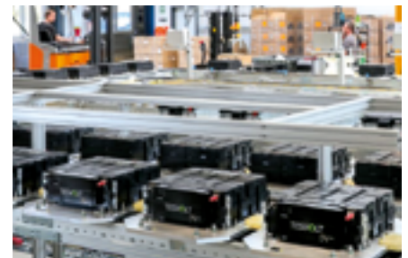
Fig. 1: EoL test track

Our entire production is carried out in Germany. With our unparalleled "end-of-line" test track (EoL, see Fig. 1), we test, inspect and cycle every battery cell and battery module before delivery. We thereby ensure that we always install and deliver "fresh" and 100% tested battery modules .